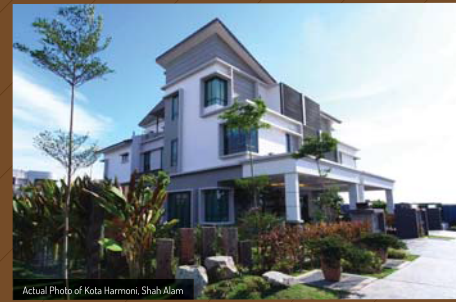
Actual Photo of Kota Harmoni, Shah Alam