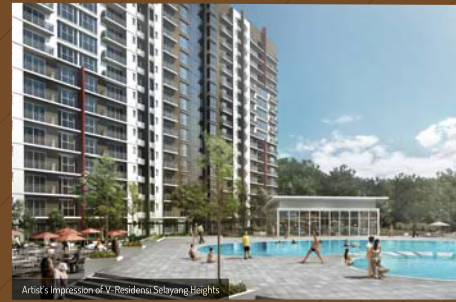
Artist's Impression of V-Riverside, Seremban Heights