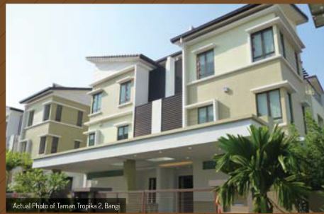
Actual Photo of Taman Tropika 2, Bangi