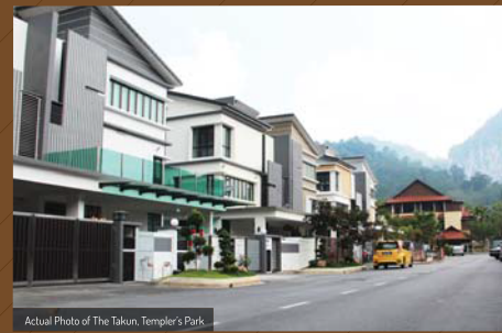
Actual Photo of The Takun, Templer's Park