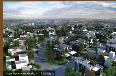
Artist's Impression of Kingsley Hills, Putra Heights

STARTING OUT AS A CIVIL CONSTRUCTION AND BUILDING CONTRACTOR IN 1995, B&G GROUP HAS ALWAYS ASPIRED TO BE AT THE FOREFRONT OF QUALITY AND INNOVATION. WITH ITS VAST EXPERIENCE AND EXPERTISE IN THE INDUSTRY, B&G VENTURED INTO PROPERTY DEVELOPMENT IN 2005 WITH PROJECTS IN THE KLANG VALLEY, PORT DICKSON AND ISKANDAR MALAYSIA. IT IS THROUGH DELIVERING QUALITY RESIDENTIAL AND COMMERCIAL PROPERTIES THAT CONTINUOUSLY DRIVES US TO REACH NEW HEIGHTS.