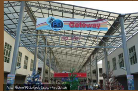
Actual Photo of PD Surgipedia Gateway, Port Dickson