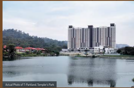
Actual Photo of T-Parkland, Templer's Park